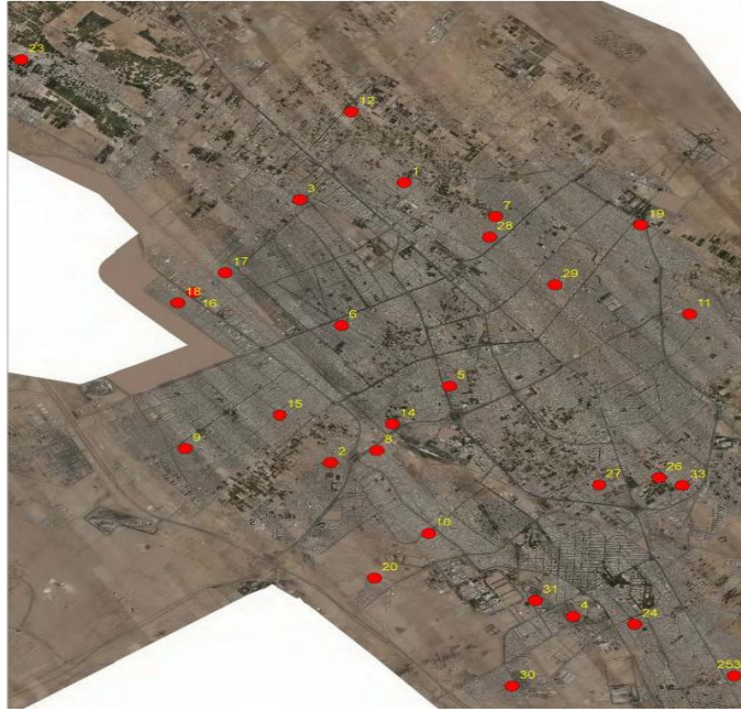
Figure 1: Map of sampling points in Yazd

First, based on a random list generated by SPSS software version 26, 33 regions were randomly selected from 50 regions in Yazd city. In the next step, a house was randomly selected from the center of the region and measured.