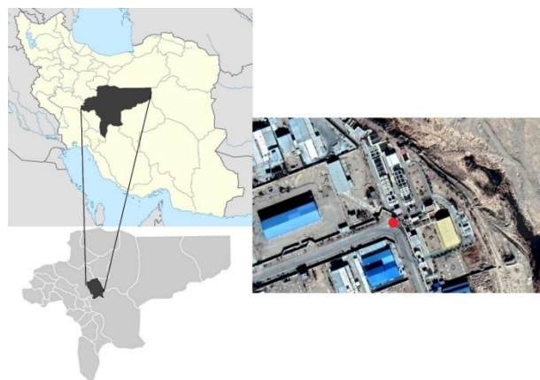
Figure 1: Earth map of the wastewater treatment plant