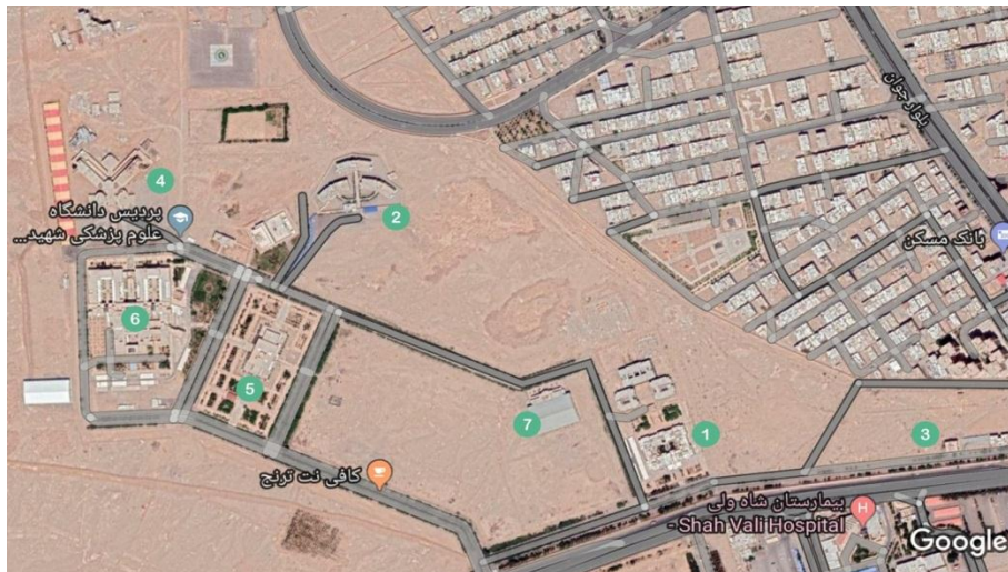
Figure 1: Campus of Shahid Sadoughi University of Medical Sciences and the study area.

Seven primary waste generation sources were identified and continuously monitored: (1) Golestan Male Dormitory, (2) Touba Female Dormitory, (3) Faculty Club (Professors' Residence), (4) School of Health, (5) Central Cafeteria (Self-Service Restaurant), (6) School of Medicine and Pharmacy, and (7) Imam Ali Sports Hall. These sites were selected because they constitute the main waste generation nodes of the campus and collectively encompass the residential, academic, recreational, and service functions of the university, making them essential for a representative assessment of campus-wide waste generation dynamics.