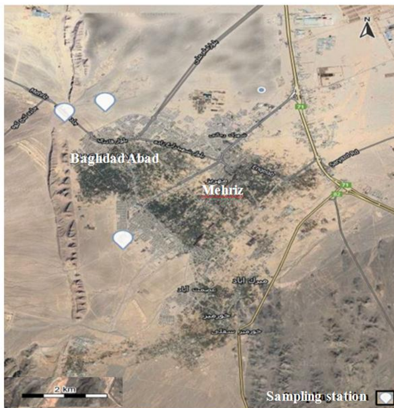
Figure 1: The location of the studied stations in Mehriz city.

It should be noted that the three mentioned points are water reservoirs used for water supply, from which sampling was done (the upper two points are related to Miankoh and Movahedin