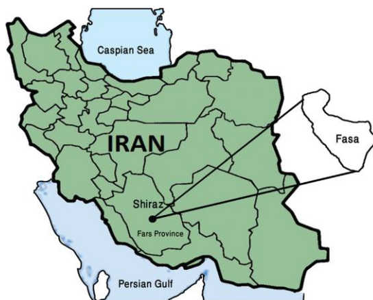
Figure 1: Map of Iran showing the location of study in Fasa city, southern Iran

The place of the study, Fasa city is located in the south of Fars province between 28° 56' 22" North, 53° 39' 0" East (Figure 1). Its altitude from sea level is about 1450m, and the inhabitant population of the city is approximately 200,000 people. The area of this town is 4302km 2 space and it is about 145km far from Shiraz, the capital of Fars province, Iran (Figure 1). The average annual temperature is 18.5 °C and the average precipitation is almost 300 mm annually.