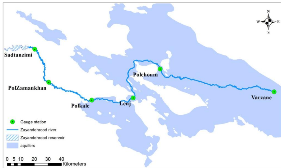
Figure 1: Schematic of the studied stations